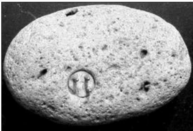
Side view of the object embedded in the rock.

Within an error of about 0.2 mm for all dimensions, the petradox is 61 mm long, 38 mm wide (at its widest) and 22 mm high (excluding the pins/rods/prongs). Using an